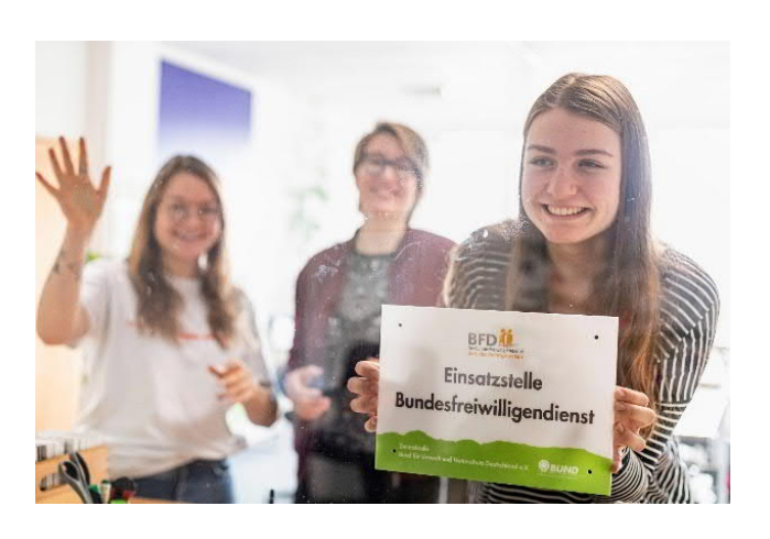
You can find the right position for you on our online placement map or on the <u>BAFzA</u> webpage.

Each place of assignment must be allocated a central office that consolidates the interests of the places of assignment and tends to centralised administration.